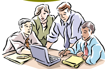
Working Hard to make it happen

Waaf has a Community of followers that believe in helping each other for the common good of all.